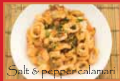
Salt & pepper calamari