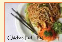
Chicken Pad Thai

Ma Pao Tofu (Minced Pork) 麻婆豆腐 $12.00 Szechwan's famous dish of crispy silken tofu in vegetarian sauce